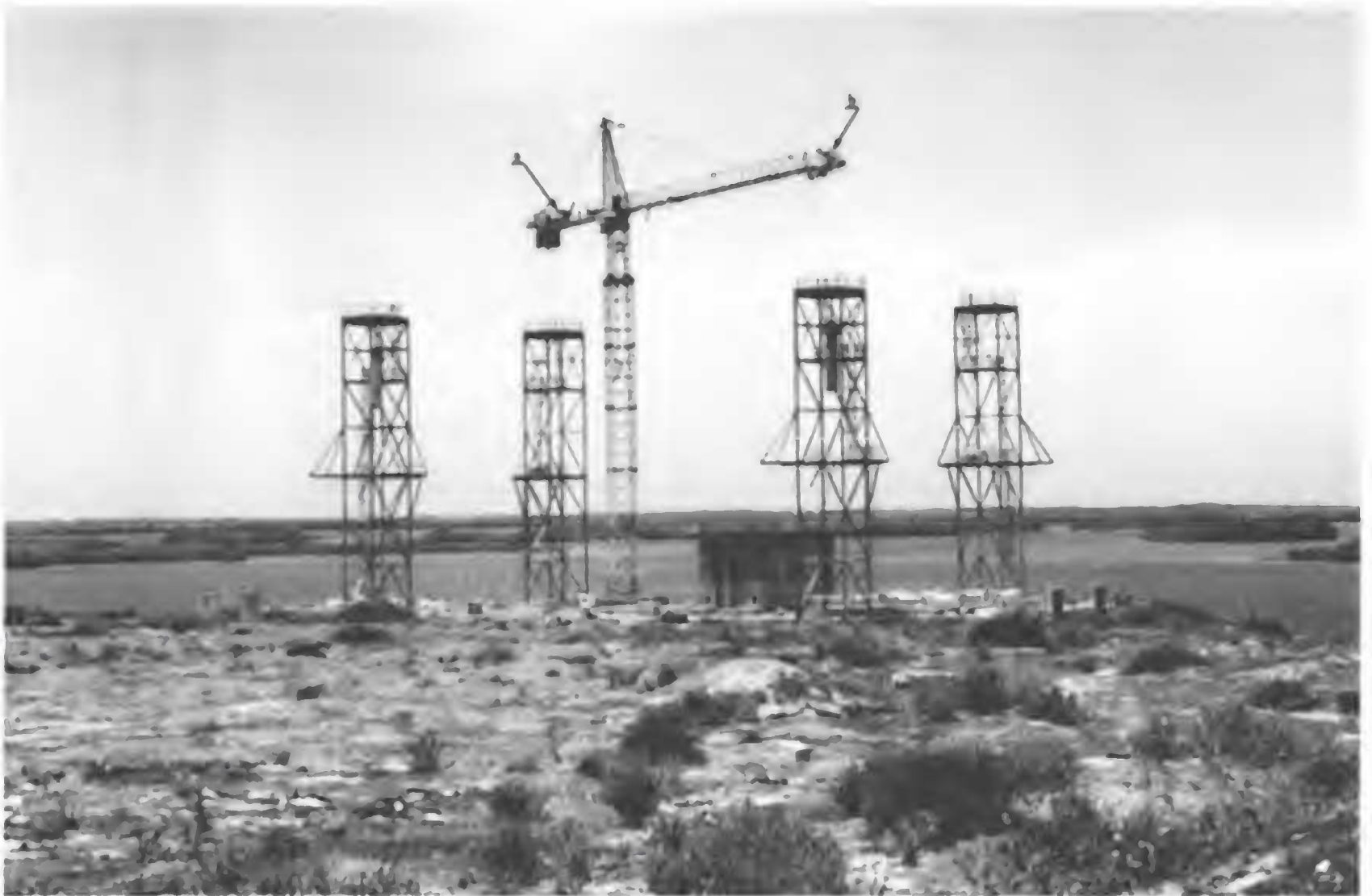
Figure 2. View of Santa Elenita mangrove estuary in Bahía Magdalena, B. C. S., México, and Peregrine Falcon (a) and Osprey (b) nesting sites.

m of the nest. We observed 16 interactions (0.79 events/hr), including eight with Magnificent Frigatebirds ( Fregata magnificens ), four with Ospreys, three with Common Ravens ( Corvus corax ), and one with a gull ( Larus sp.). Peregrines made territorial attacks or cacking-calls in all interactions.